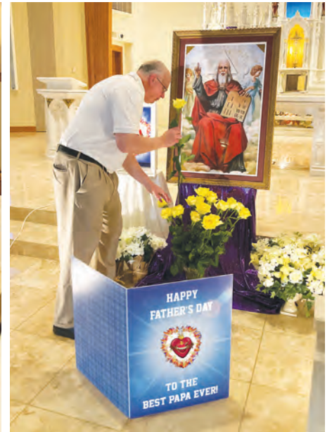
Lay Brothers Rose Ceremony at the 7 P.M. Service in the United Hearts Chapel