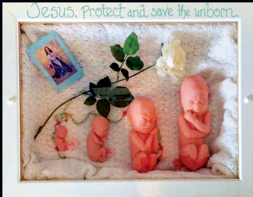
Stages of fetal development on display in the White Madonna Shrine at Maranatha Spring and Shrine

CHOOSE LIFE. PRAY THE ROSARY OF THE UNBORN