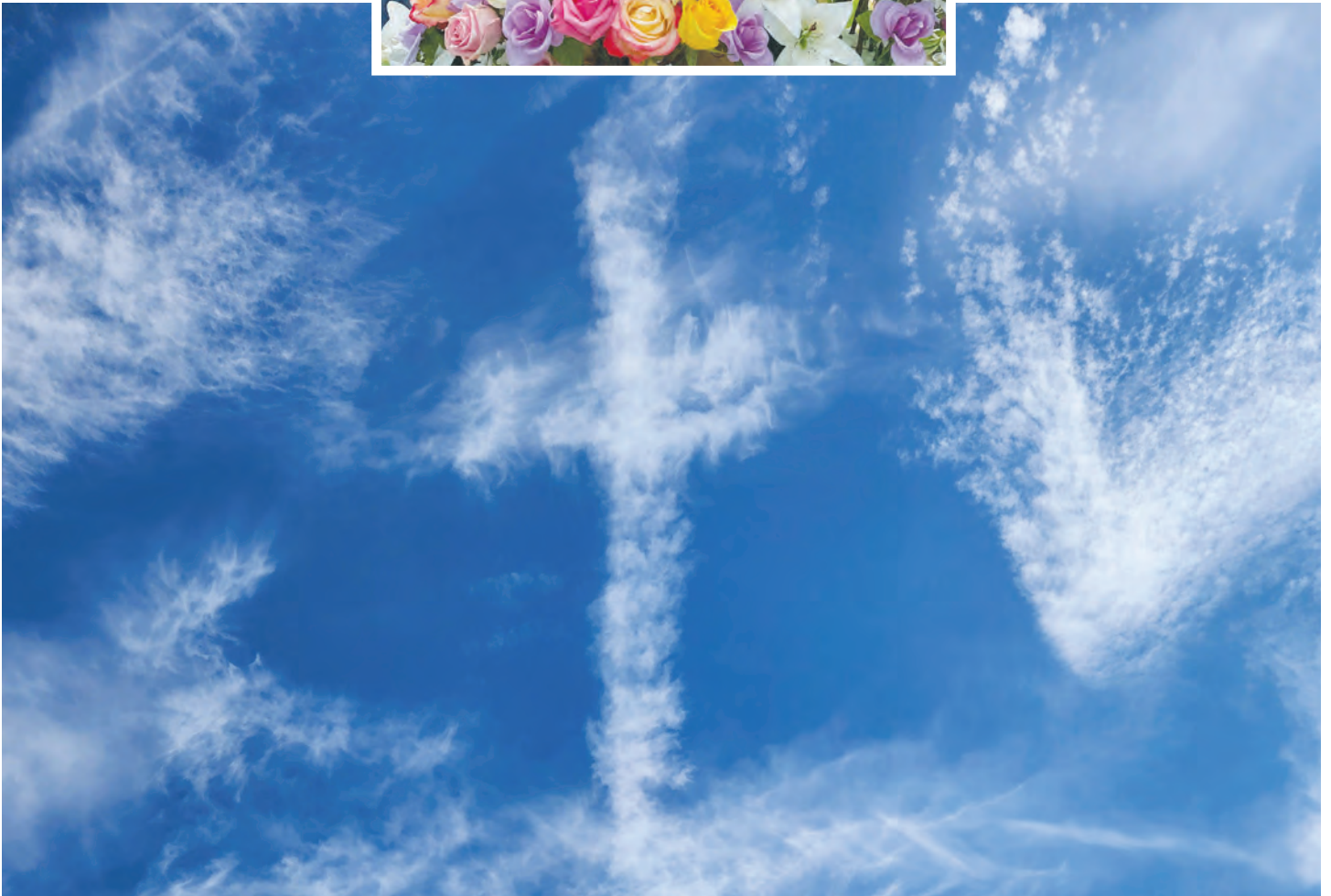
Extraordinary Photo of the Sky over Maranatha Spring and Shrine on April 14, 2023